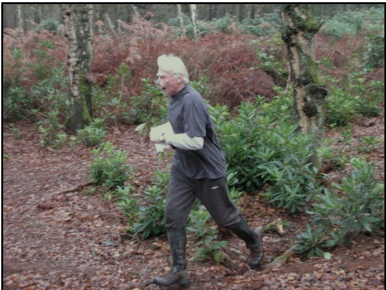
The Fixtures Secretary hurrying between tasks