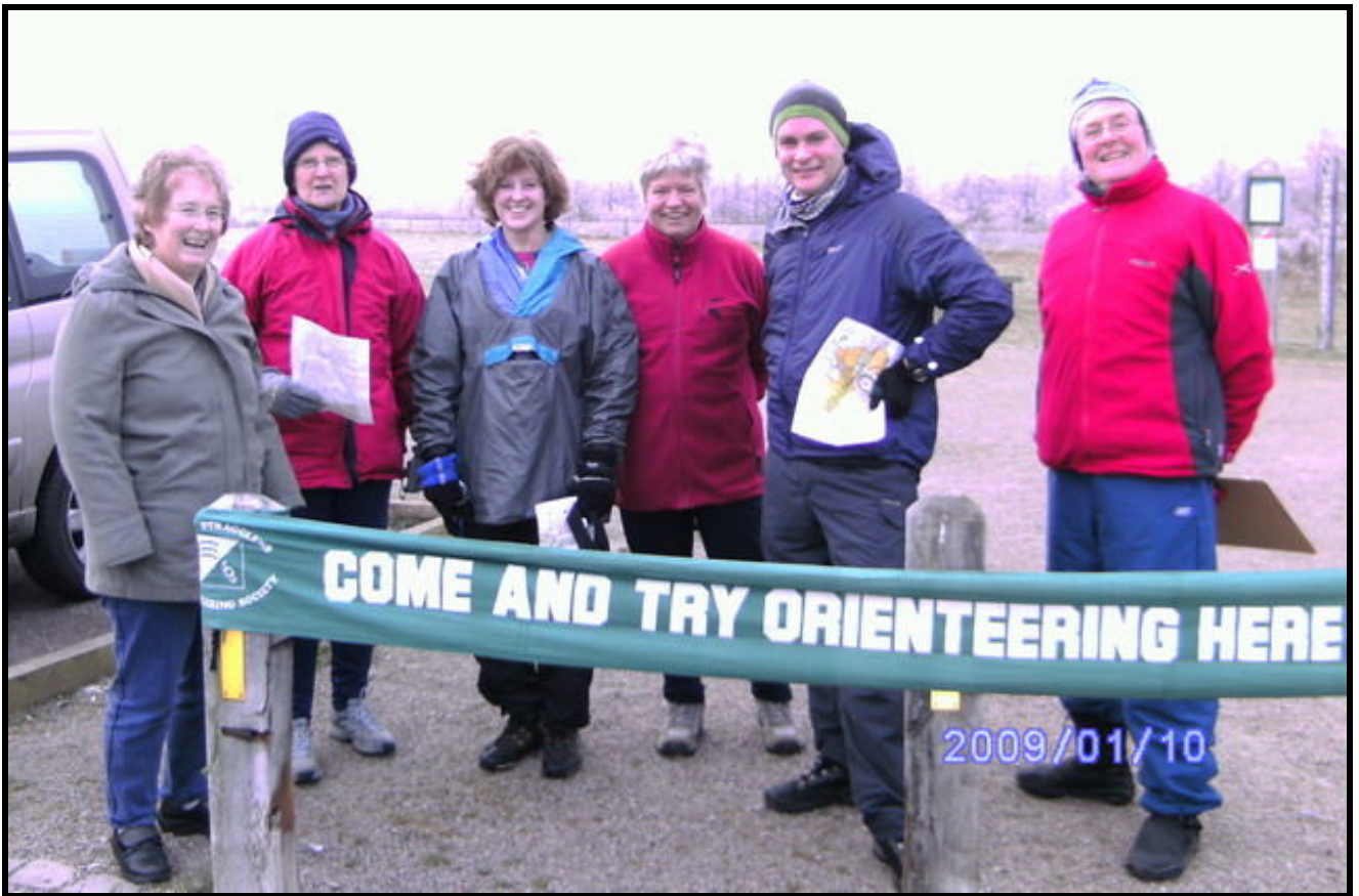
At the opening of the Fordham permanent course